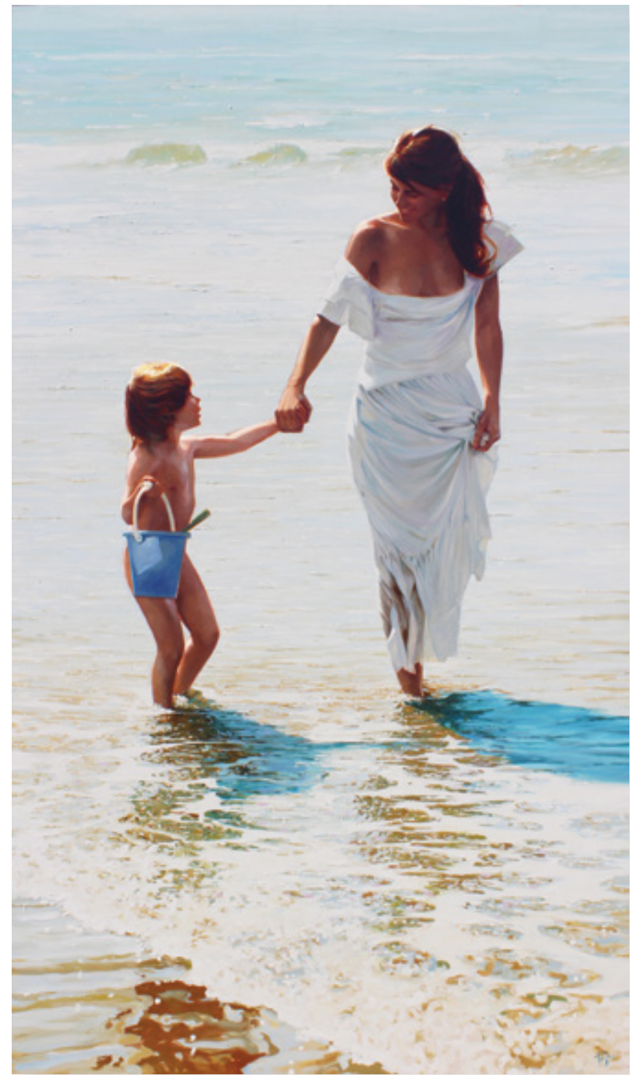
PASSEJANT A LA VORA DEL MAR

Oil on Canvas · 57 1/16 x 38 1/16 Inches · FG©135125