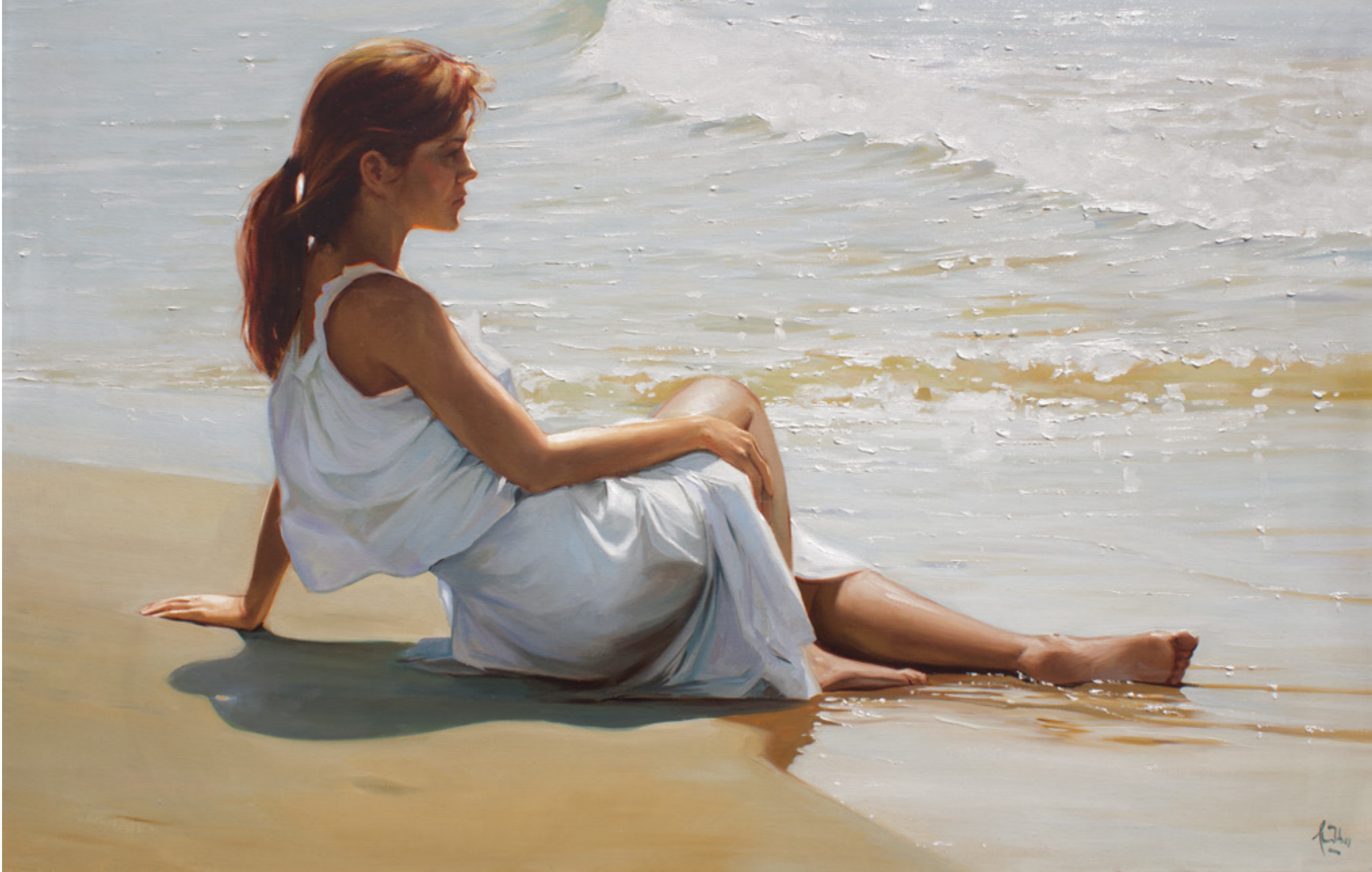
EN LA ORILLA DEL MAR Oil on Canvas • 23 6/8 x 36 1/5 Inches • FG©138677